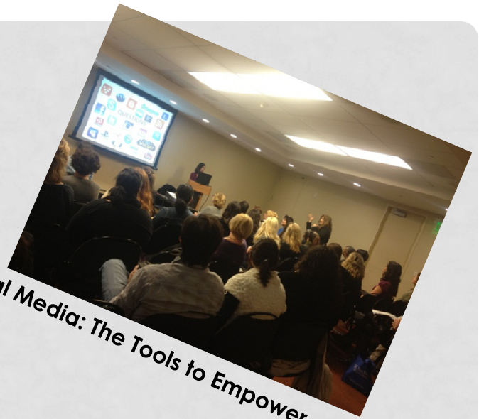
Social Media: The Tools to Empower or Transform