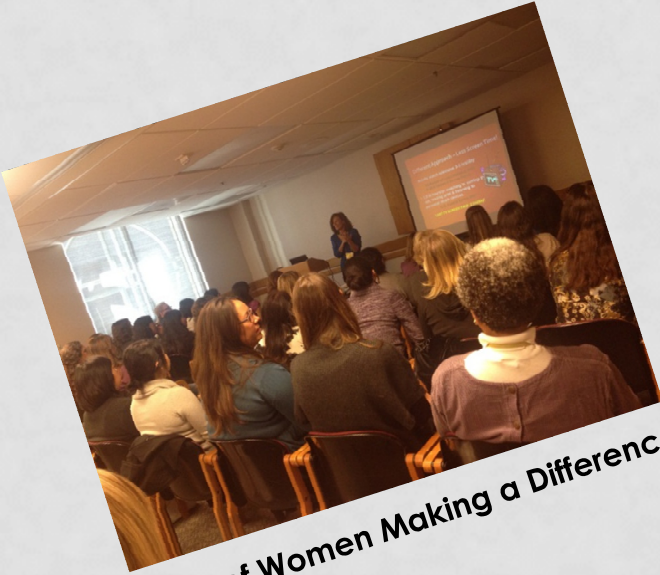
The Power of Women Making a Difference